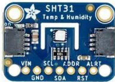
Fig.4 SHT31 Temperature and Humidity Sensor