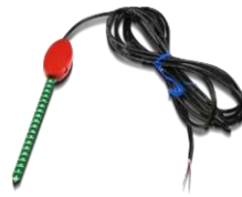
Fig.5 Vegetronix VH400 Soil Moisture Sensor