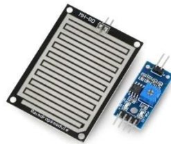
Fig.2 YL-83 Rain Sensor