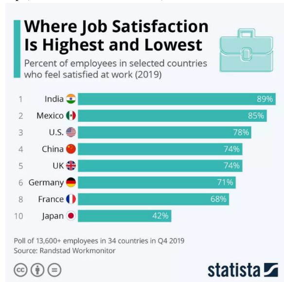
Figure 1 Randstad Workmonitor survey of 34 countries on Job Satisfaction

countries that were sampled while Japan was on the top (The Times of India, 2021).