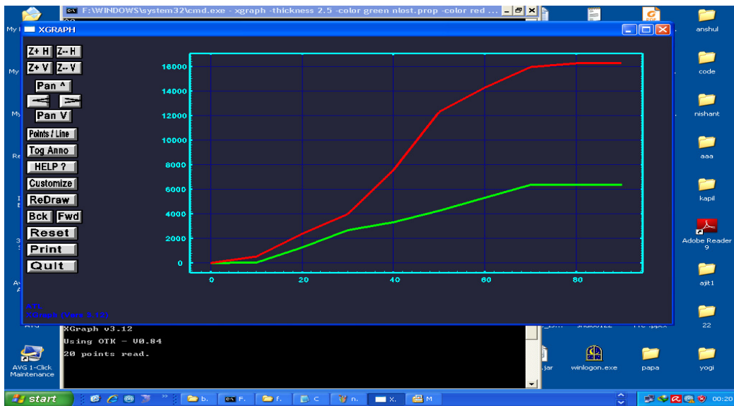
Figure 2: Packet Transmission Analysis

Here figure 1 is showing the communication parameters based on the random scenario taken in this work. The scenario is defined with specification of network parameters, communication parameters and the protocol specification. The table shows that the network nodes are defined with energy restriction. The communication control is provided in this work using AODV protocol.