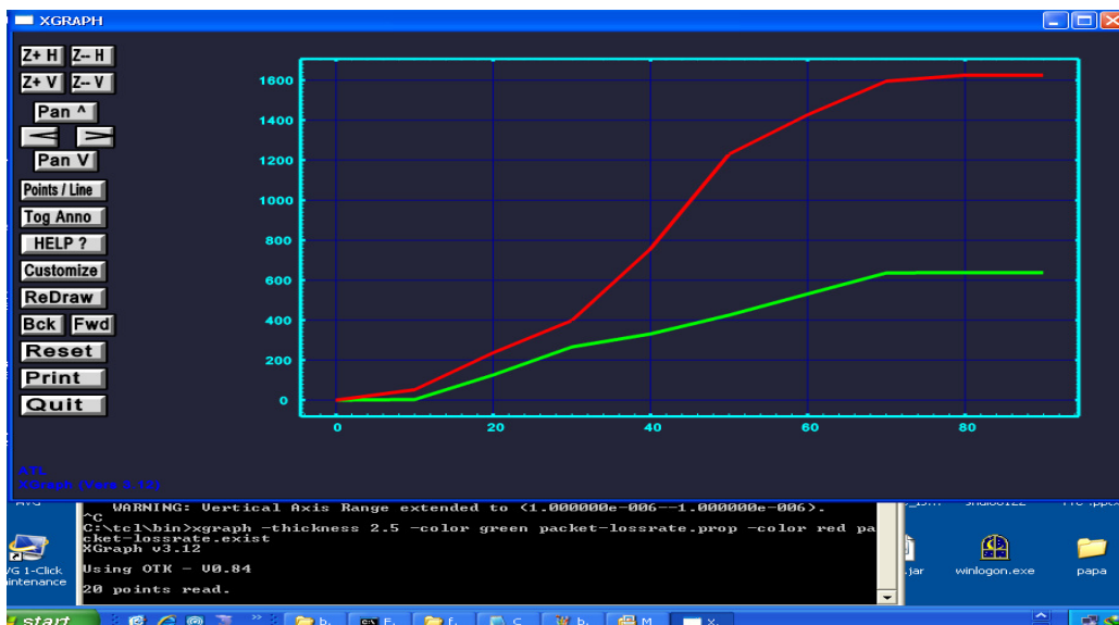
Figure 3: Packet Loss Analysis

Figure 2 depict that the packet communication is been increased continuously in proposed approach. As the nodes are dead no more communication is performed over the network. Here straight line represents the dead network situation. In this figure, x axis represents the simulation time and y axis shows the packet communication. Here the figure is showing the packet communication specifically for proposed work. The figure shows that initially the packet communication in case of proposed work is higher.