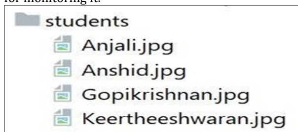
Figure 2 The student photos have to be uploaded in the student's folder.

Fig.2 detecting the image and uploading it to a database for monitoring it.